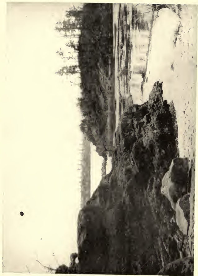
RIVER BANK DOWN WHICH THE INDIANS WERE DRIVEN At Peskeompskut (Turner's Falls), Massachusetts